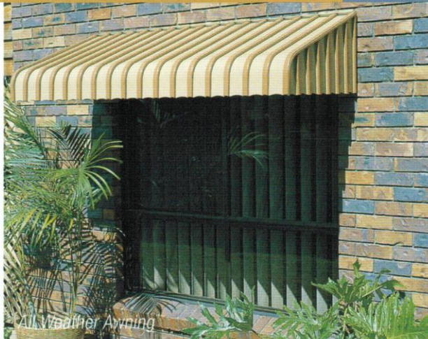
All Weather Awning

The Horizontal Stripe style is for the budget buyer and consists of horizontal panels.