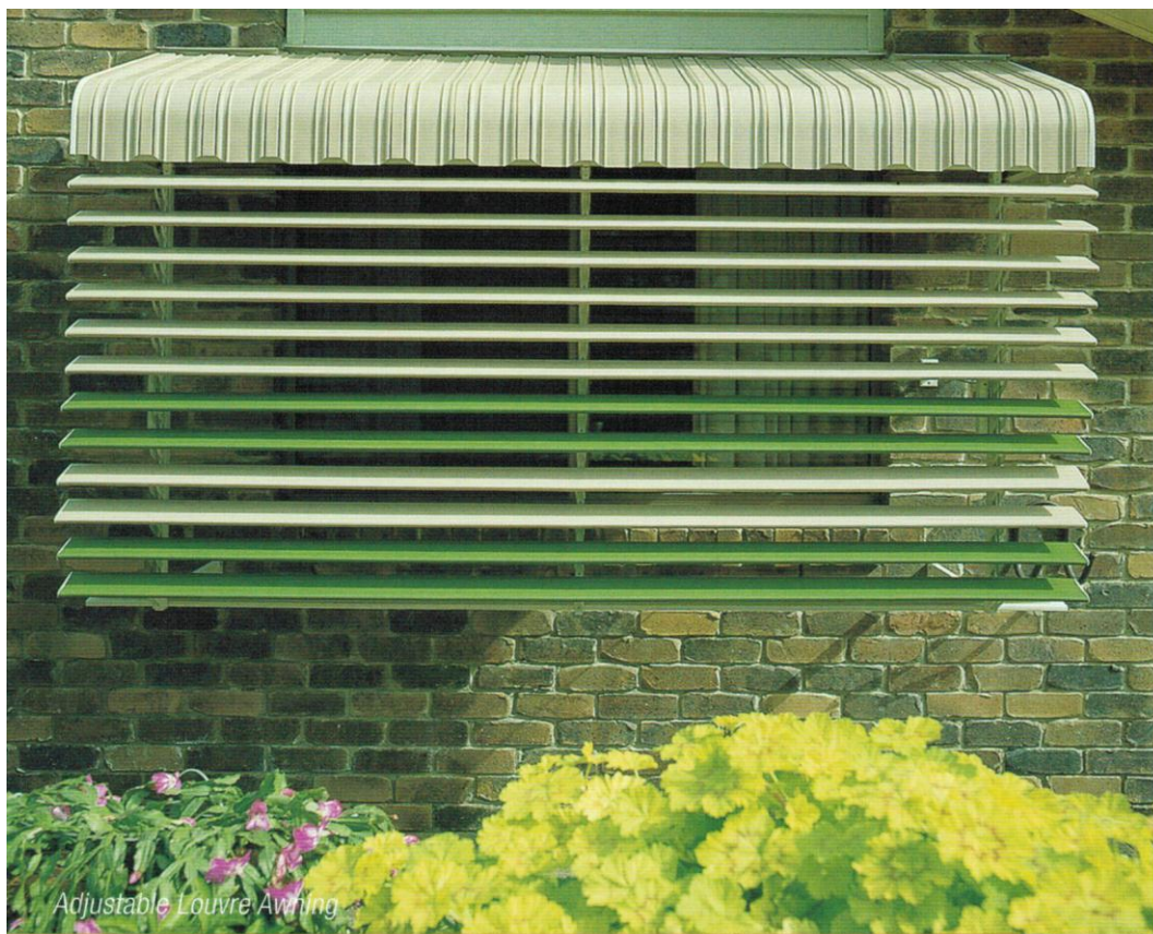
Adjustable Louvre Awning