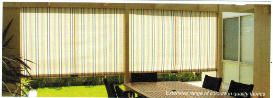
Extensive range of colours in quality fabrics

Discover a simpler way to shade and protect your outdoor way of life.