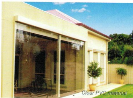
Clear PVC material