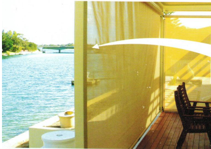
Ziptrak® blind in hi-tech solar fabric